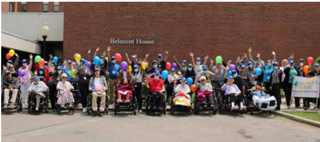
Celebrating the 13th annual Walk & Roll!