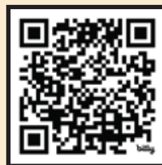
Video 3 Here Comes the Sun

Note: For more details on our accomplishments in 2023, plans for 2024, and the Strategic Plan 2019-2024, please read our 2024 Operating Plan and our Strategic Plan, which are available at Belmont House and on our website: www.belmonthouse.com