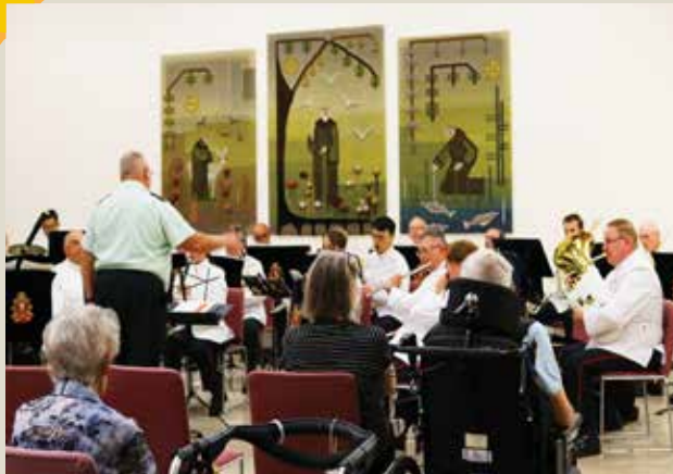
Our annual The Band of the Royal Regiment of Canada is always a highlight of the year!