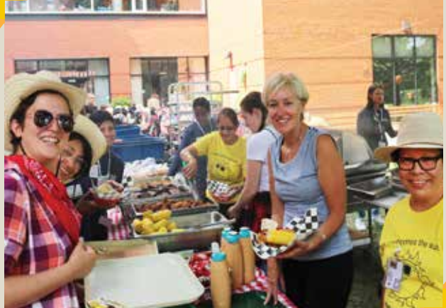
Summerfest is an annual highlight for everyone with lots of great food and entertainment!