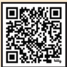
Video 1 Journey Through the Pandemic: A COVID-19 Story

Watch our journey through the videos below.