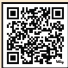
Video 2 Belmont House's Journey to a COVID-19 Vaccine