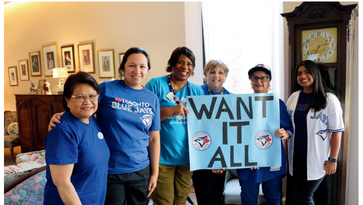
Belmont House staff celebrating the Toronto Blue Jays first World Series appearance since 1993!