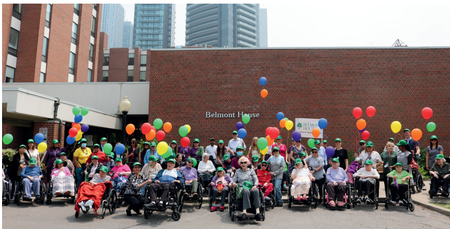
Together we raised $22,500 at the annual Walk n' Roll!

This list includes all gifts received between January 1-December 31, 2025. Every effort is made to ensure proper recognition of each donor.